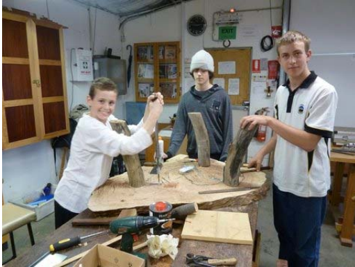
Left: Students at work fitting the “natural” legs.

A most eventful year culminated in Stromlo High School students completing the large natural-edge coffee table shown below, which is now proudly displayed in the Stromlo High Achievement Centre (our thanks to Graham Hargense for providing the superb slab for the project).