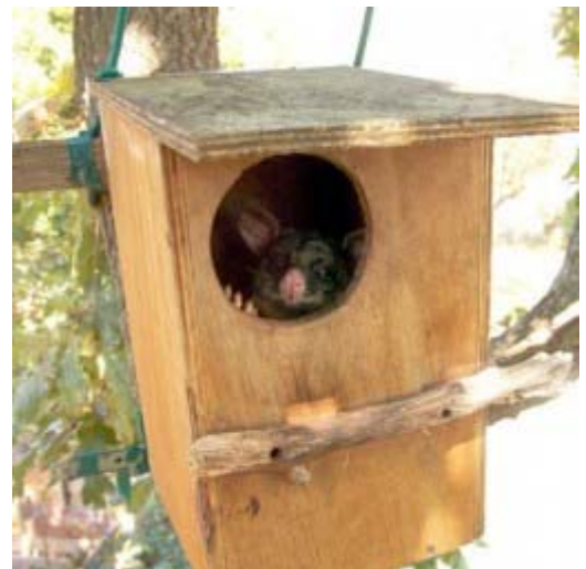
"Where are my complimentary gladioli?"