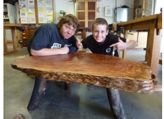
Right: Proudly displaying the finished product.

The projects undertaken by the students during the year are too numerous to detail, but most importantly the students were learning in an environment that provided a stable, positive and safe workplace; something not otherwise readily obtainable for these young people.