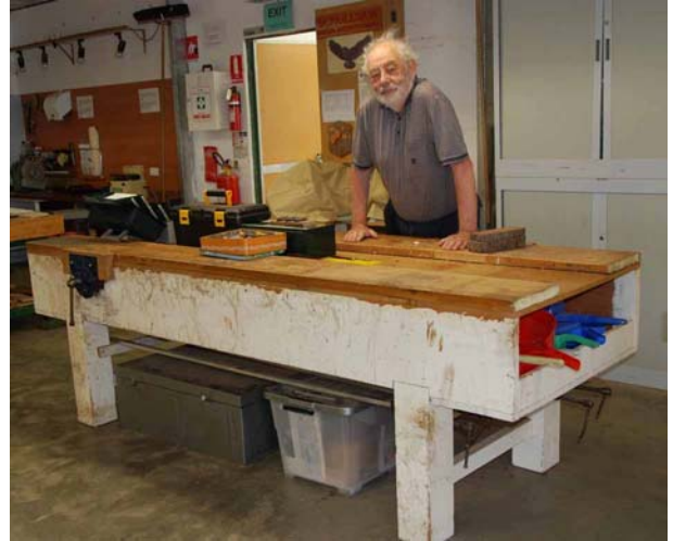
Accessories (especially JA) not included