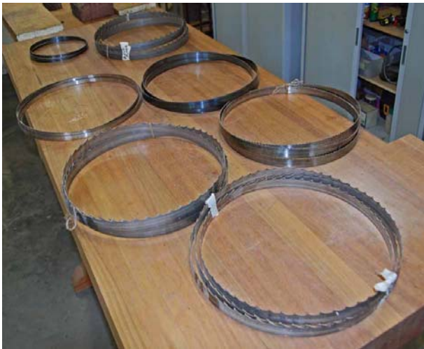
Bandsaw blades for sale

Since we are now only using these new blades, we have a number of older blades for sale to members. These still have good life left in them after some re-sharpening. They are mostly wide blades for a 21" bandsaw (see photo), and we would be prepared to accept offers starting around $5 per blade.