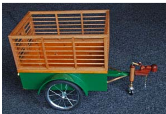
Models – Leigh Brown