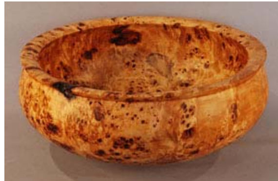
Turning Faceplate – Greg Holcombe