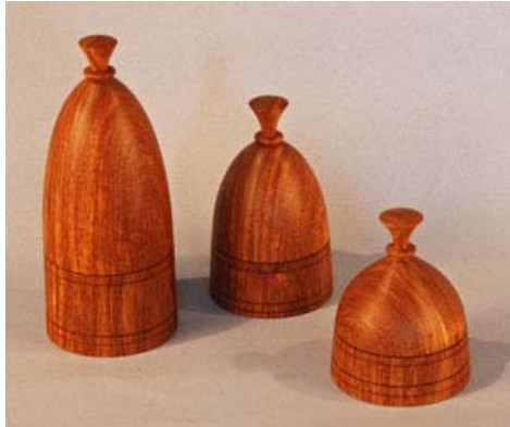
Turning Between Centres – Robin Cromer