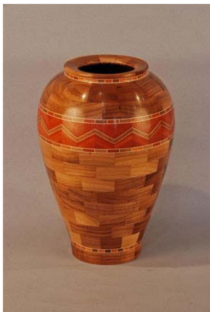
Open Turning – Ken Vodden