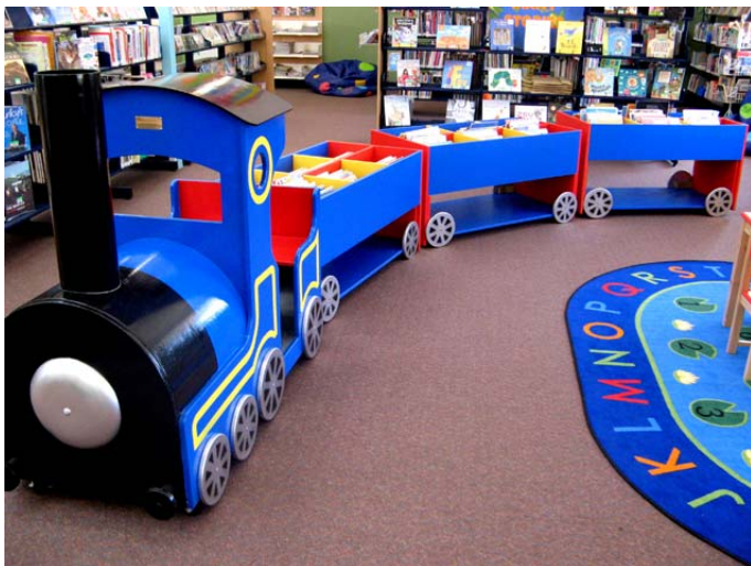
Left: The Bungendore Book Train on track.