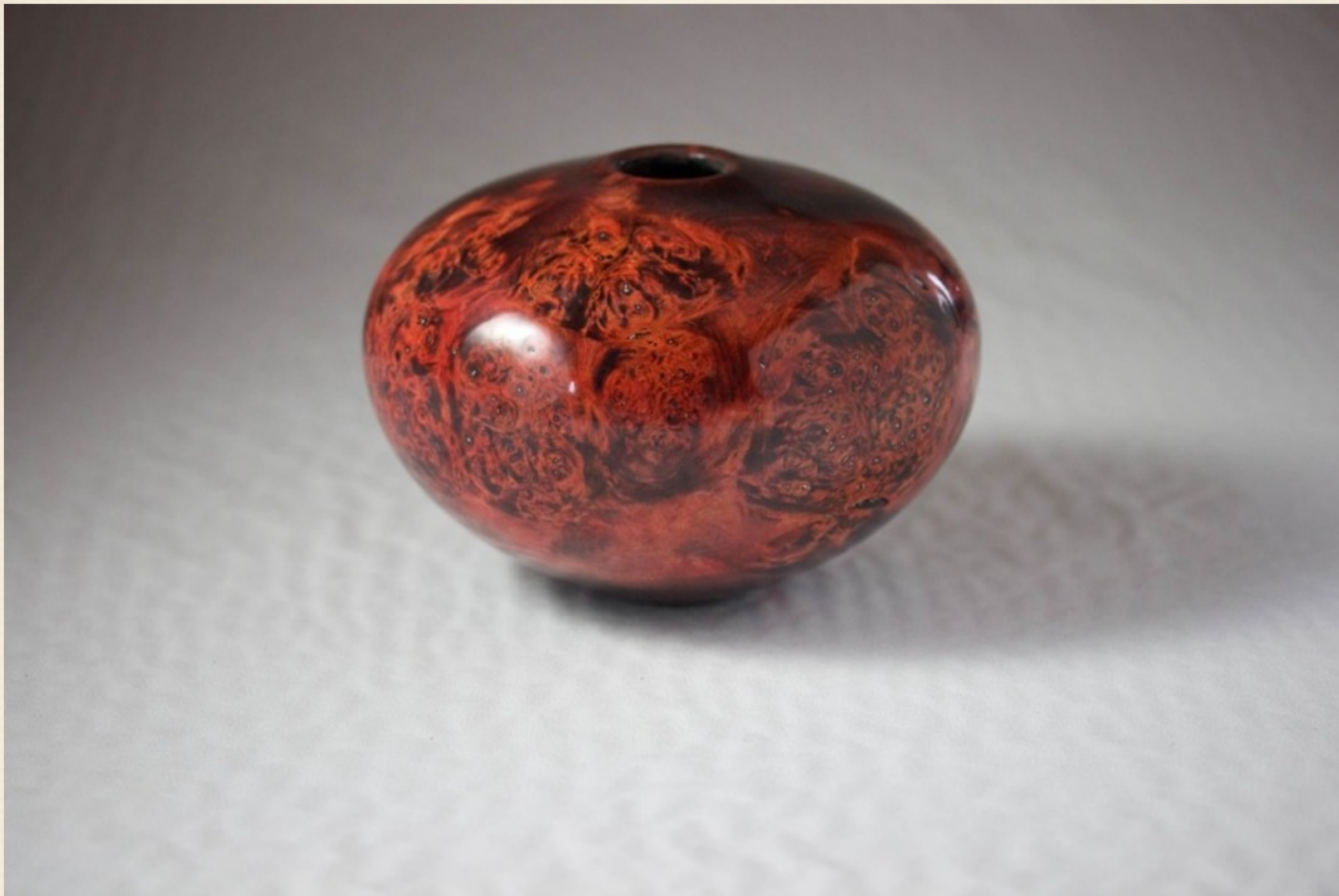
Horse Chestnut 7" x 4"