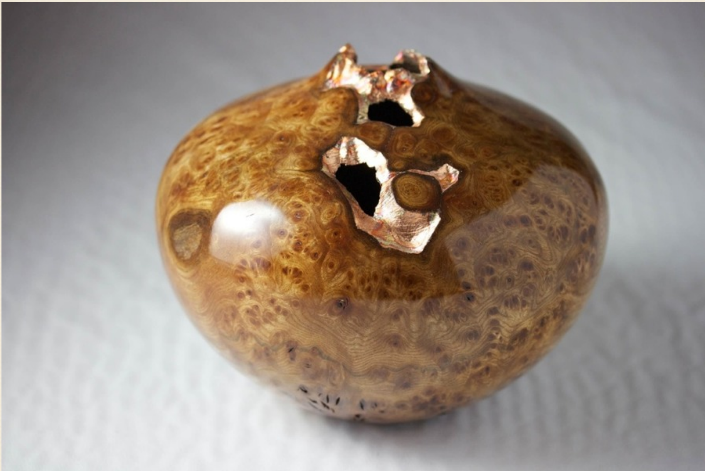
Burr Elm and metal leaf 9" x 6"