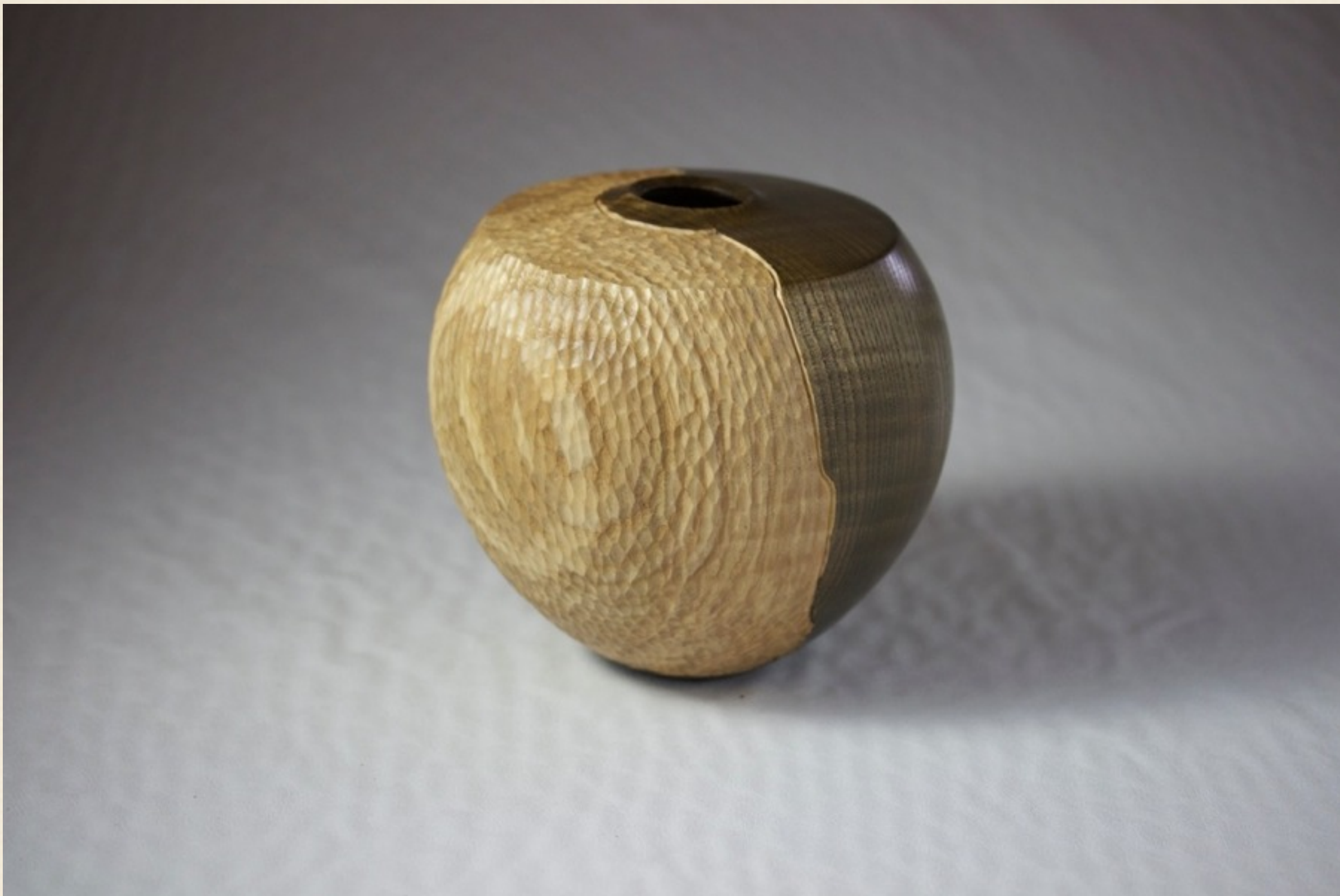
Olive Ash dyed with vinegar and wire wool and carved 5" x 5"