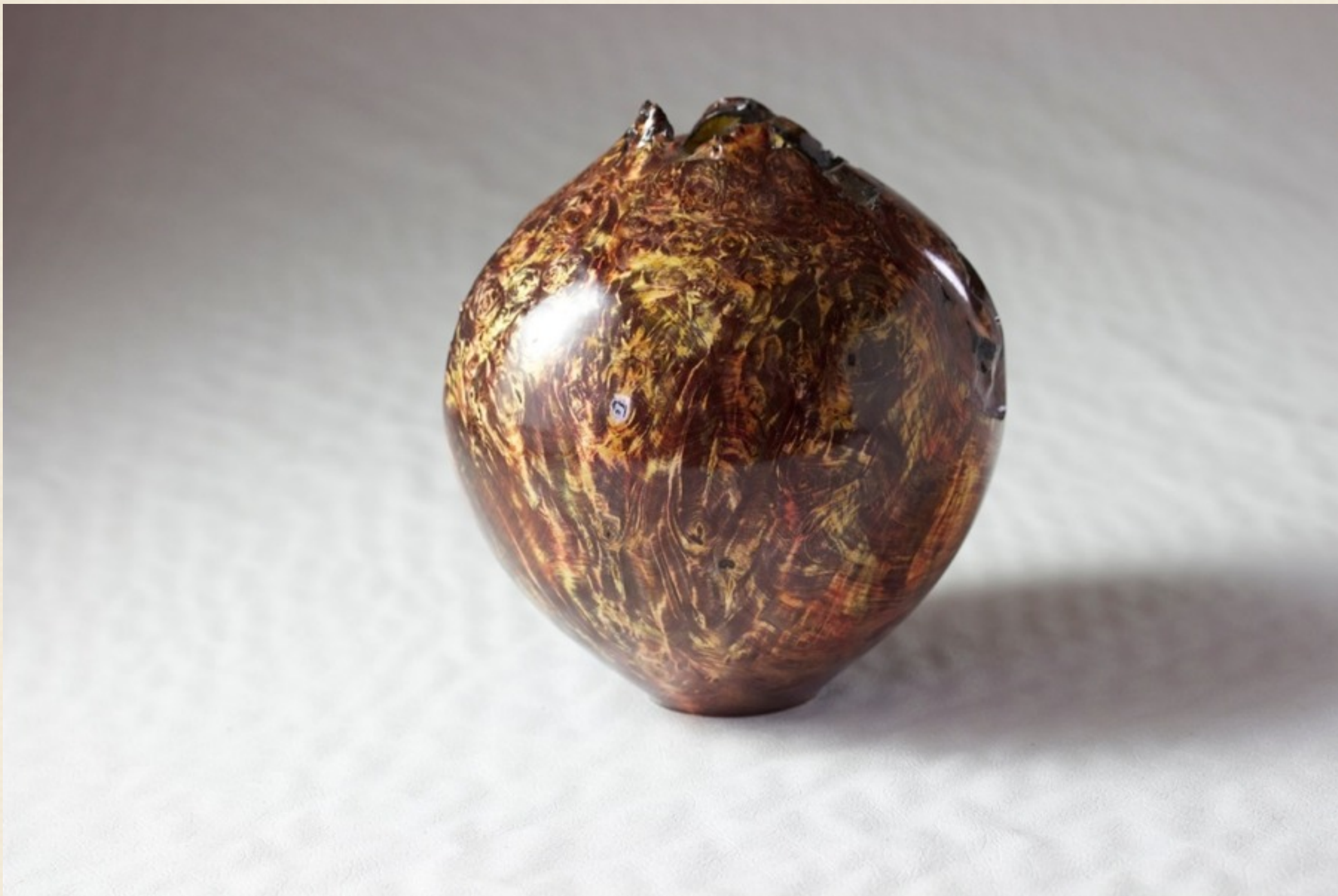
Horse Chestnut 4" x 3"