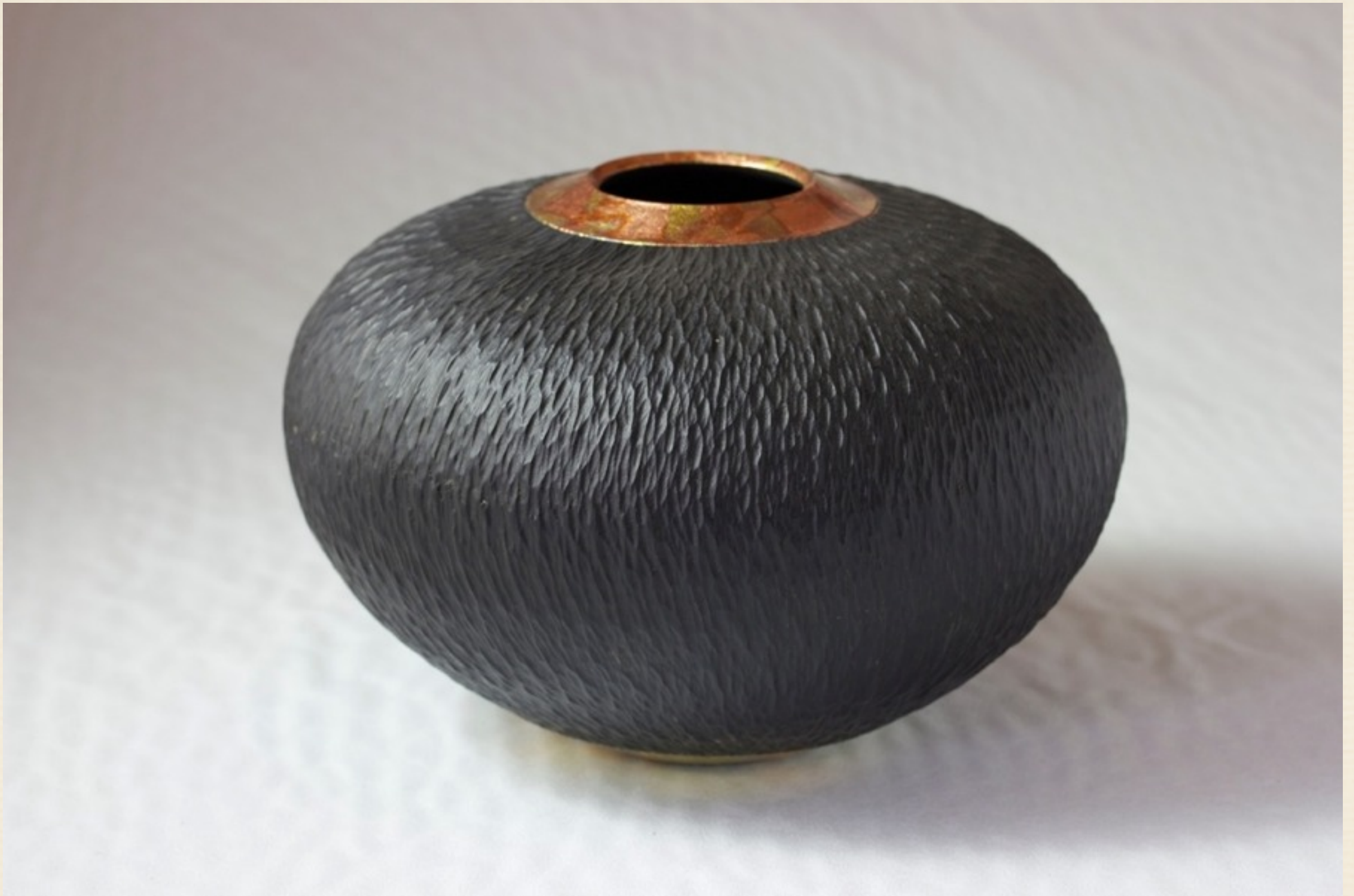
Sycamore textured and sprayed black with metal leaf 11" x 8"