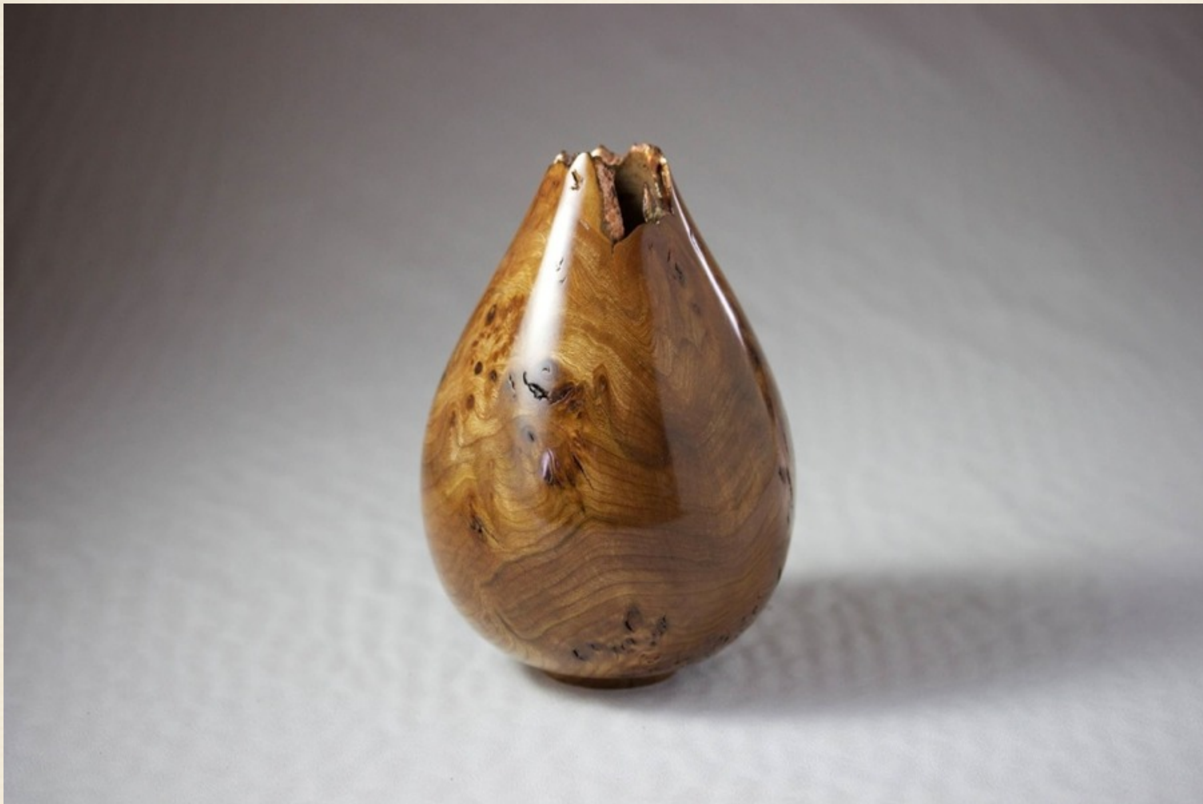
Natural top Burr Elm 6" x 3"