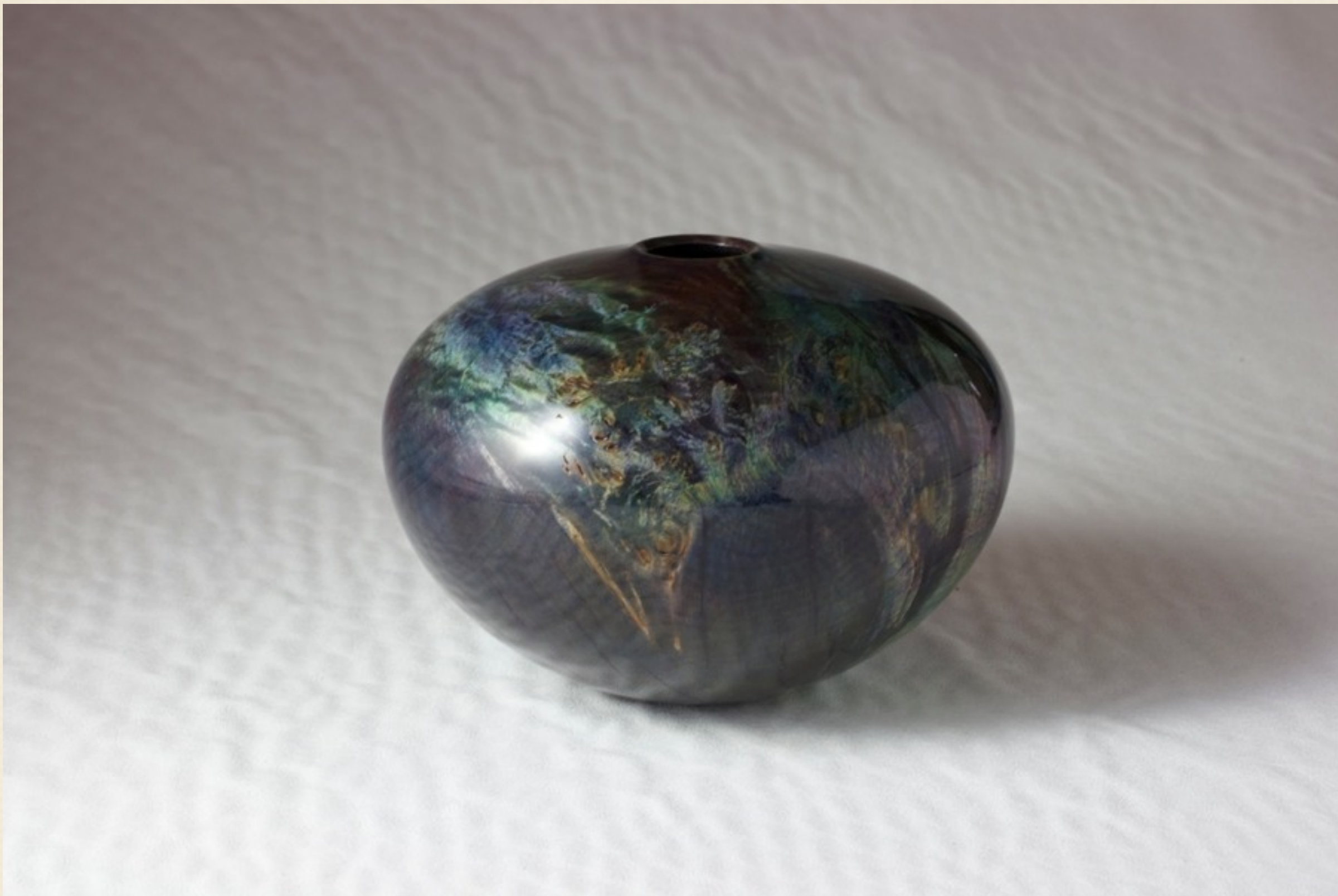
Norway Maple coloured 8" x 5"