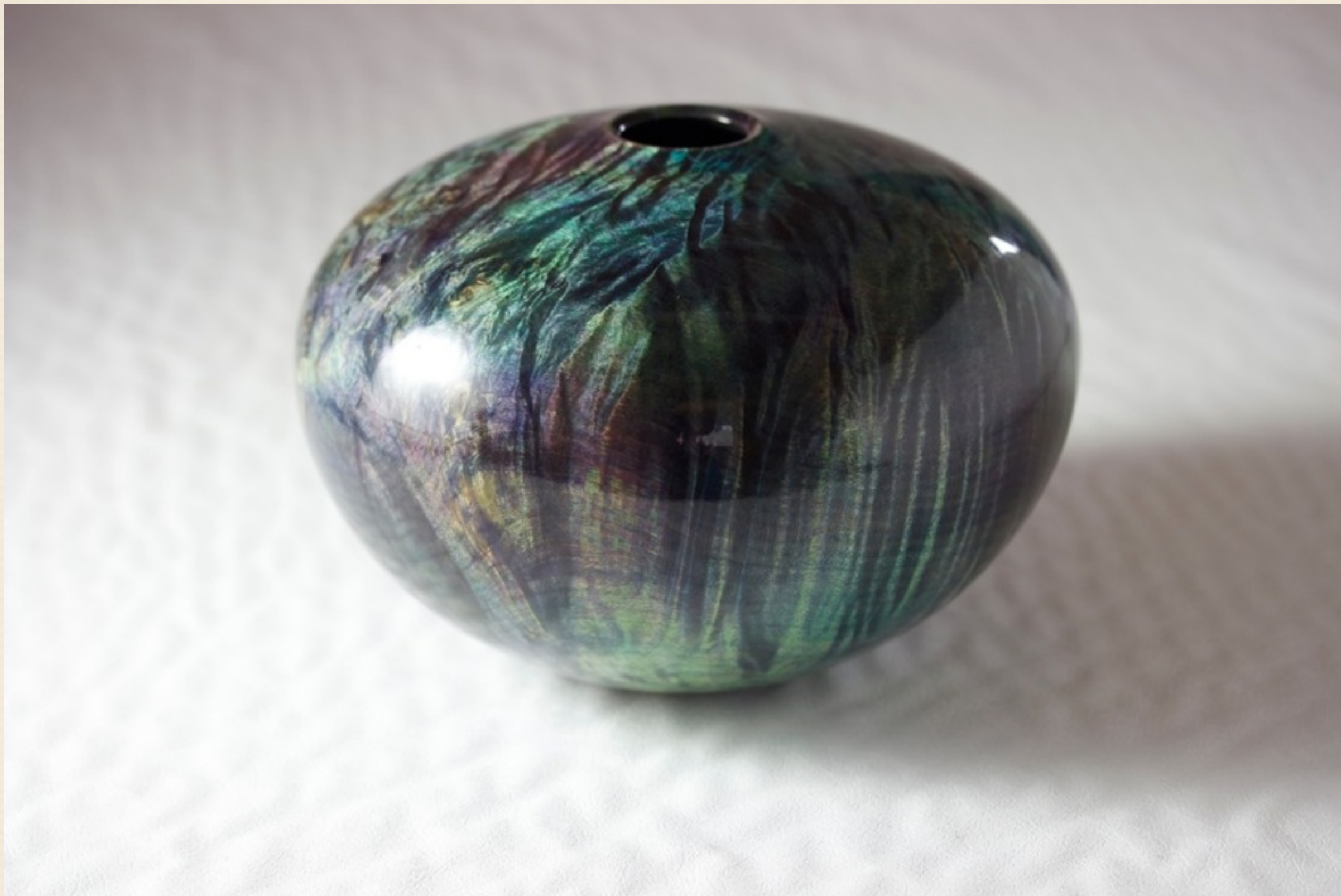
Norway Maple coloured 8" x 5"