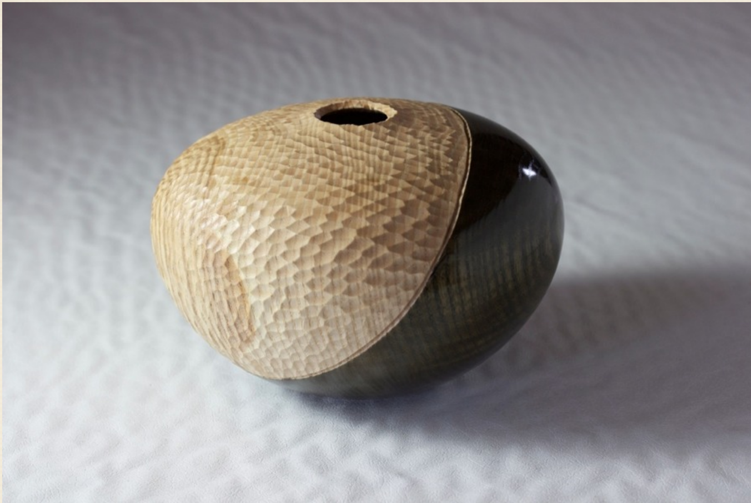
Olive Ash dyed with vinegar and wire wool and carved 6" x 4"