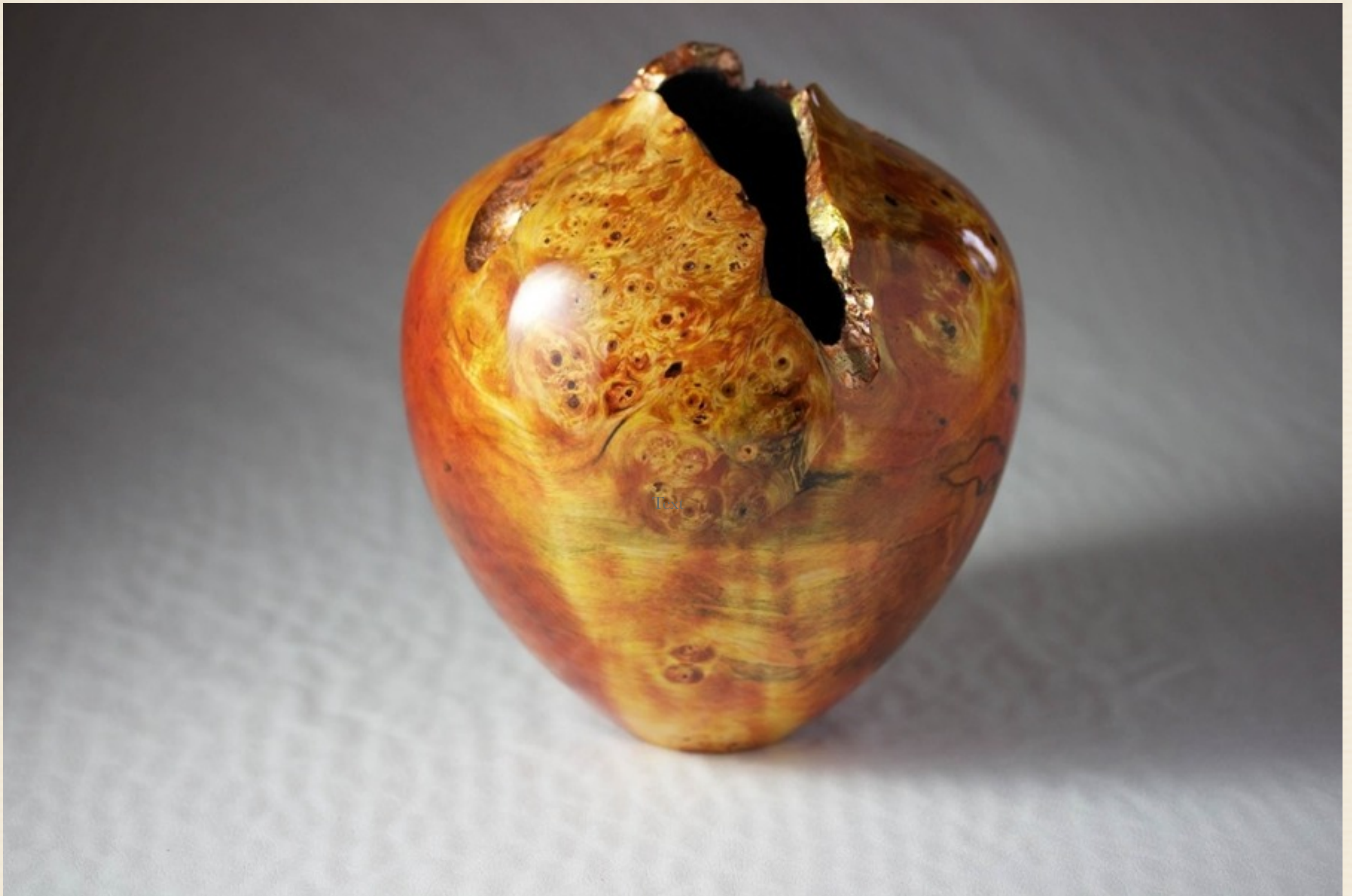
Horse Chestnut Burr with metal leaf on the natural edge 8" x 5"