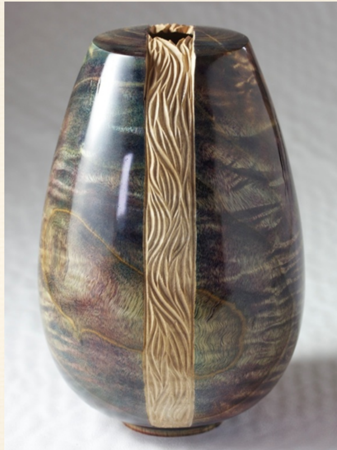
Eucalyptus Gunnii 10" x 4"